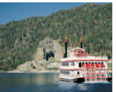
From top: Olympic Rings at Squaw Valley, Sand Harbor, MS Dixie and Cave Rock.